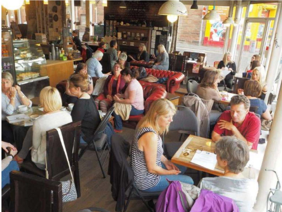
The world's first Menopause Café, June 2017 at Blend Coffee Lounge, Perth