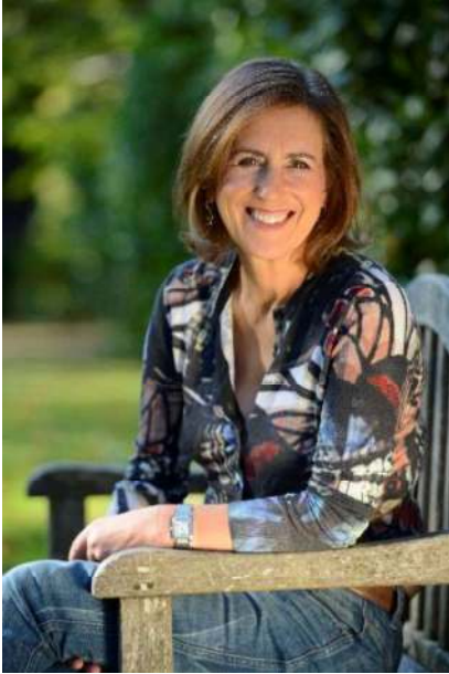
Kirsty Wark, our patron

We gained charitable status by becoming a SCIO, SC048435, in June 2018 and were delighted when Kirsty Wark became our patron, saying;