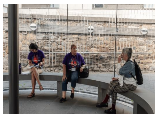
Volunteers at the listening bench