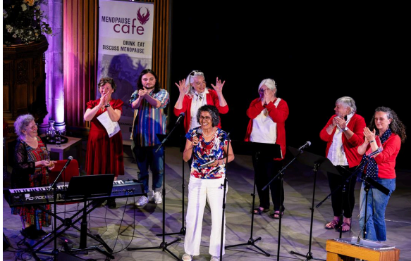
The Friday Night Cabaret Performers