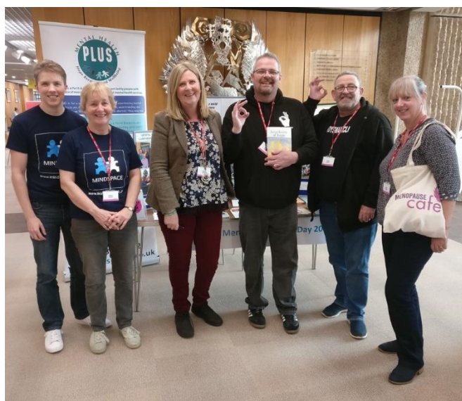
Oct 10 th : Mental Health Awareness event at Aviva, Perth, with Andy's Man Club and Mindspace.