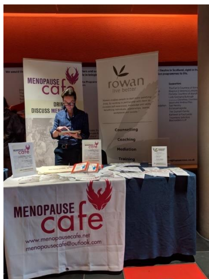
October 5 th : Women of the World Festival in Perth (WoW).

To meet our aim of increasing awareness about the Menopause, we participated in several national events: