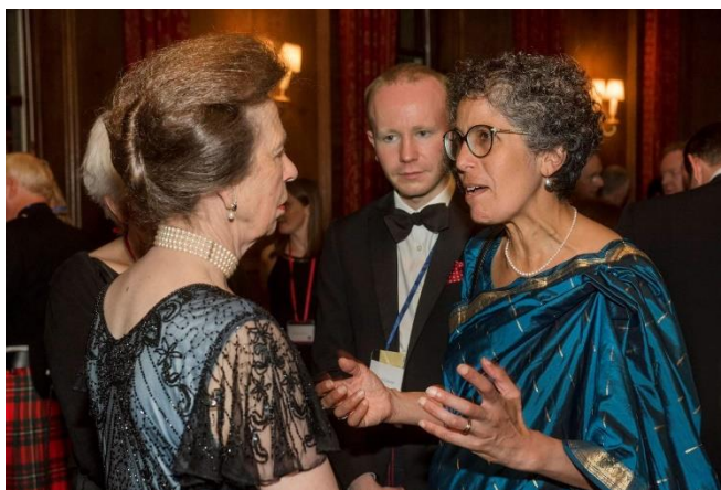
Oct 9 th : Telling Princess Anne about our work, at an Edinburgh University dinner at Holyrood Palace.